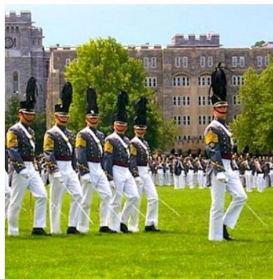
West Point Dress